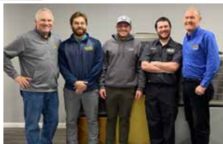
"Three Generations Strong"